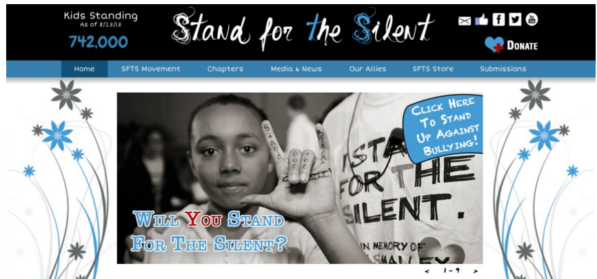
Stand for the silent